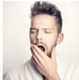
Relieve Symptoms of Insomnia