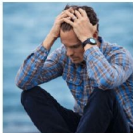
Alleviating The Symptoms of Depression and Anxiety